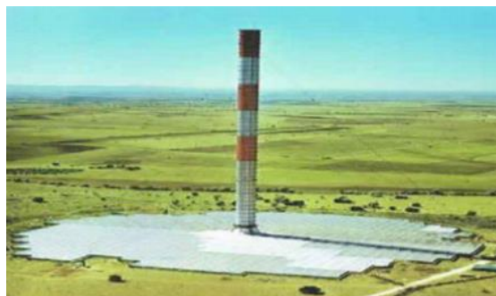
Fig.1. Solar chimney power plant in Manzanares [3]

systems by the maximization of the produced power and the minimization of the cost of the installation. About the theoretical and experimental studies, relating to the performance of solar chimney power plants (SCPP) led these last years: for the experimental ones, it should be noted that they are practically focused on the Mansanares prototype; for the fundamental studies, carried out by [3], the authors have presented a short discussion on energy balance, criteria of design and cost of the system and energy production analysis. The experimental prototype of a solar chimney power plant was realized and tested in Manzanares, Spain, in the 1980s.