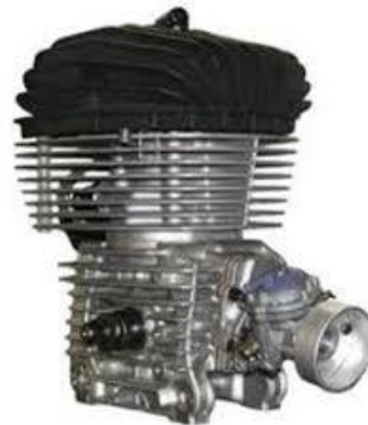
Figure 2: Automobile Fin

A fin is an area that extends from an object to increase the rate of heat transfer to or from the environment as convection increases. The amount of conduction, convection, radiation of an object determines the amount of heat it transfers. By increasing the temperature difference between the object and the environment, increasing the heat transfer coefficient or increasing the surface area of the object increases the heat transfer. Sometimes it's not cheap or you can not change the first two options. However, adding a rib to the object increases the area of the surface and can sometimes be an economical solution to heat transfer problems. Some circumferential ribs around the cylinder of a motorcycle engine and the fins connected to the condenser tubes of a refrigerator are some known examples.